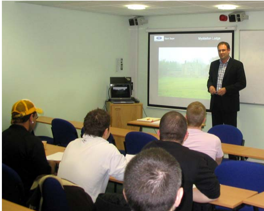
FIGURE 7: Virtual tours embedded within PowerPoint presentations

is understandable that they might initially be sceptical or indeed cynical about the motivations for developing such materials. Maximum benefit, it is suggested, will be gained by using VR materials in a holistic teaching and learning approach which values existing approaches. Aspen and Helm (2004) argue that this mix or blend of approaches can be of considerable benefit to students, leading to effective engagement in a range of situations.