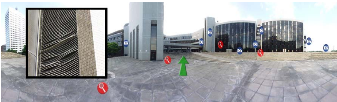
FIGURE 3: QuickTime VR panorama

IPIX is also acknowledged as being one of the sector's leading providers of digital panoramic virtual reality photography software (VRP, 2005), produces excellent results and would have lent itself to this type of application. However IPIX is normally preferred for large volume work. An annual license fee to use the software inflates the costs for low-end users and precluded its use on this project.