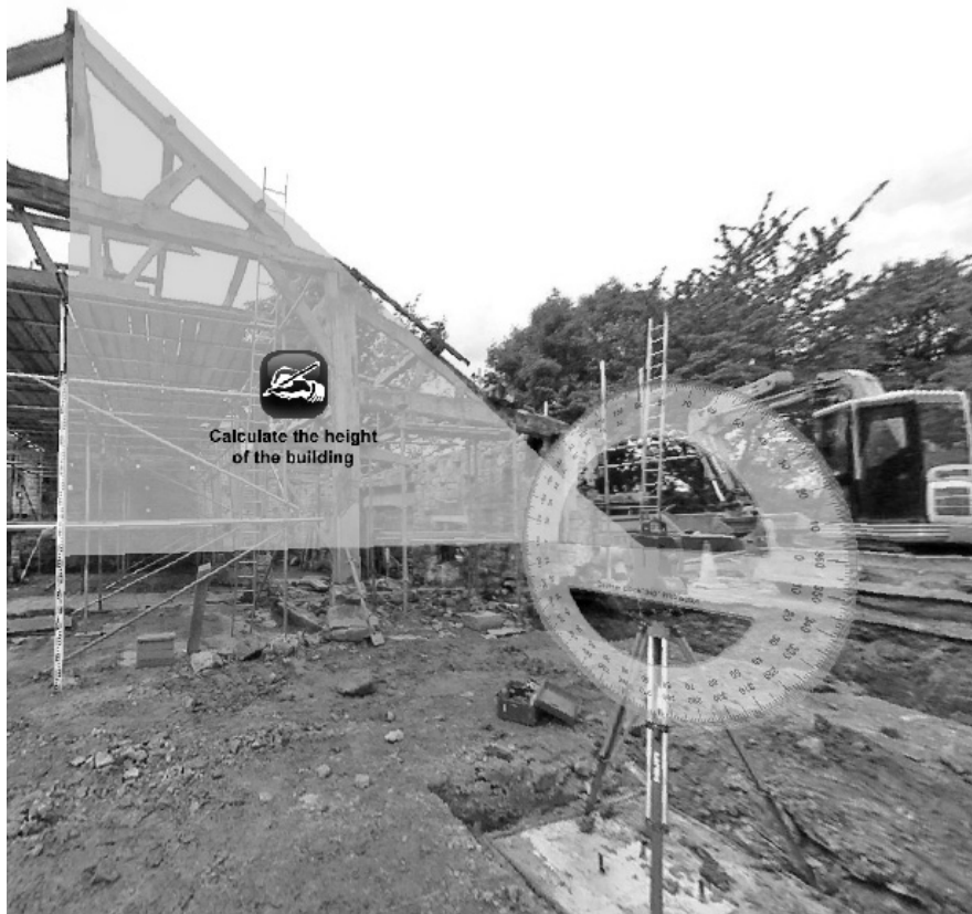
Figure 1: Image from Virtual Site Classroom showing overlay and interactive button

assist teaching and learning of mathematics. The maths tools being developed use basic maths, normally taught as part of standard secondary education, but are applied to construction situations.