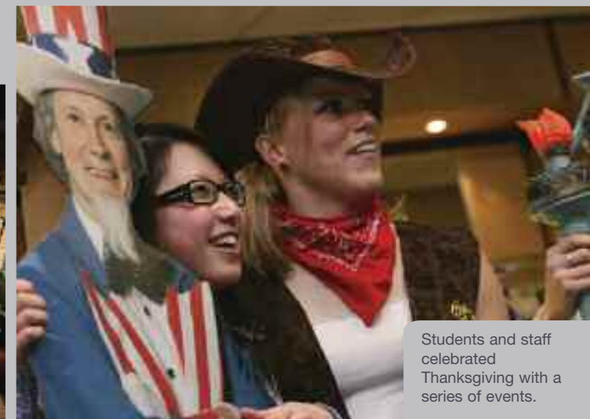
Students and staff celebrated Thanksgiving with a series of events.