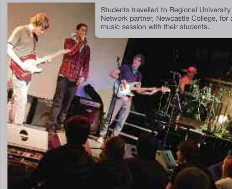
Students travelled to Regional University Network partner, Newcastle College, for a music session with their students.