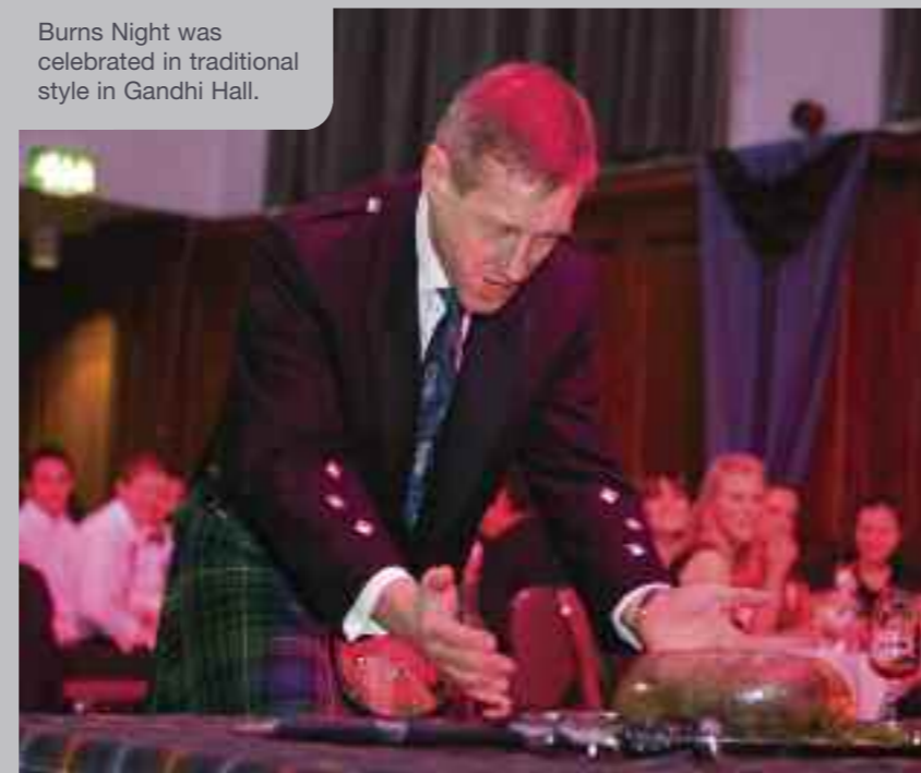
Burns Night was celebrated in traditional style in Gandhi Hall.