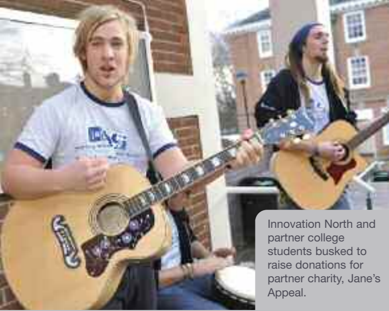
Innovation North and partner college students busked to raise donations for partner charity, Jane's Appeal.