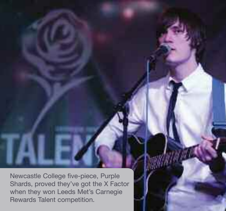
Newcastle College five-piece, Purple Shards, proved they've got the X Factor when they won Leeds Met's Carnegie Rewards Talent competition.