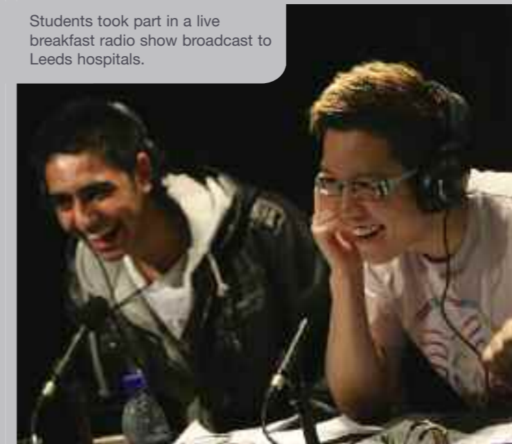
Students took part in a live breakfast radio show broadcast to Leeds hospitals.