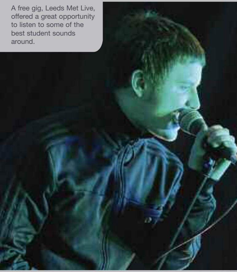
A free gig, Leeds Met Live, offered a great opportunity to listen to some of the best student sounds around.