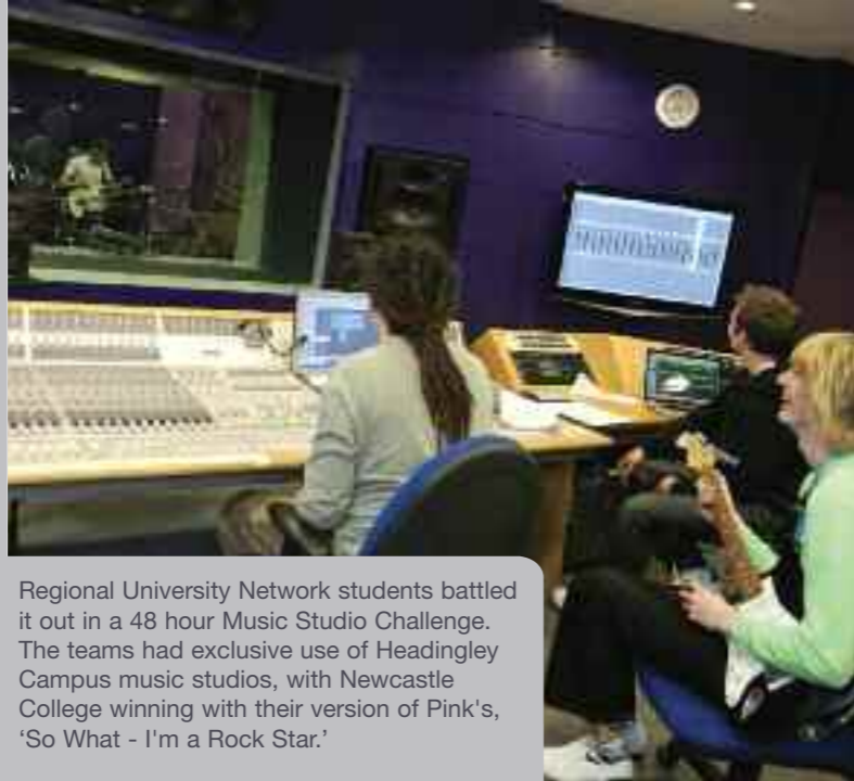
Regional University Network students battled it out in a 48 hour Music Studio Challenge. The teams had exclusive use of Headingley Campus music studios, with Newcastle College winning with their version of Pink's, 'So What - I'm a Rock Star.'