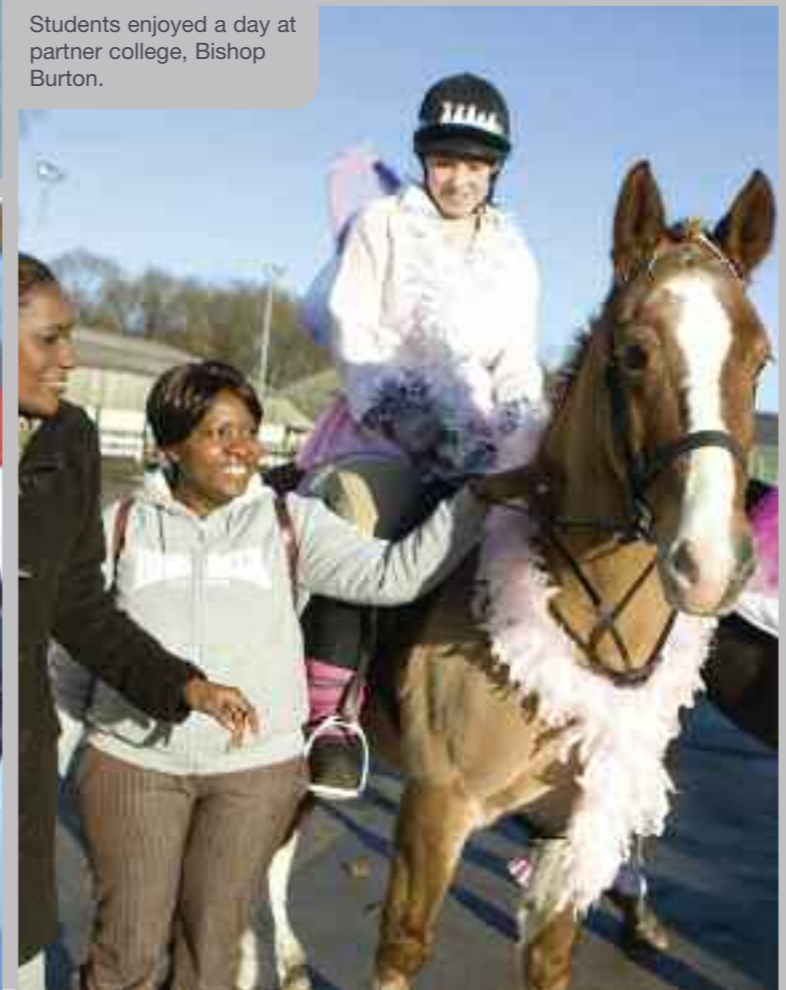
Students enjoyed a day at partner college, Bishop Burton.