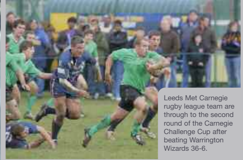
Leeds Met Carnegie rugby league team are through to the second round of the Carnegie Challenge Cup after beating Warrington Wizards 36-6.