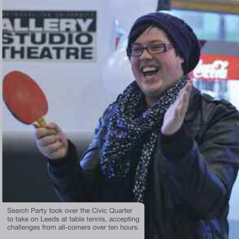
Search Party took over the Civic Quarter to take on Leeds at table tennis, accepting challenges from all-comers over ten hours.

A range of events, activities and experiences to celebrate the diversity of our world-class partnerships have been taking place across the University during the Festival of Partnerships for Students. Leeds Met and Regional University Network students have come together to learn about and experience first-hand how the University's pioneering partnerships can add to their personal learning experience, develop their talents and enhance their career prospects.