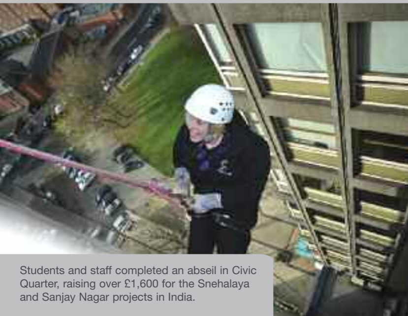
Students and staff completed an abseil in Civic Quarter, raising over £1,600 for the Snehlaya and Sanjay Nagar projects in India.