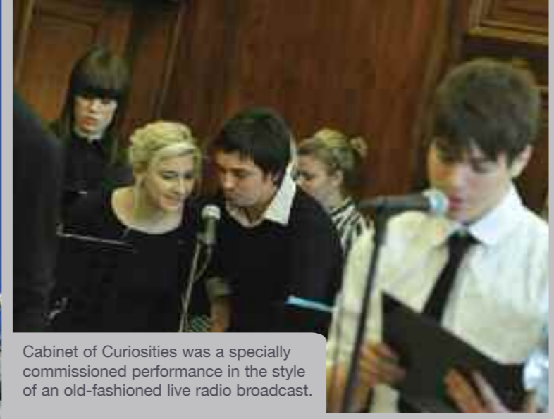
Cabinet of Curiosities was a specially commissioned performance in the style of an old-fashioned live radio broadcast.