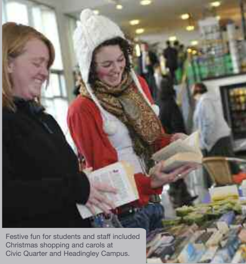
Festive fun for students and staff included Christmas shopping and carols at Civic Quarter and Headingley Campus.