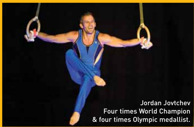
Jordan Jovtchev Four times World Champion & four times Olympic medallist.