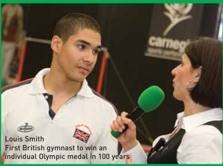
Louis Smith First British gymnast to win an individual Olympic medal in 100 years