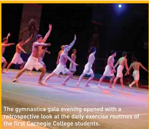
The gymnastics gala evening opened with a retrospective look at the daily exercise routines of the first Carnegie College students.