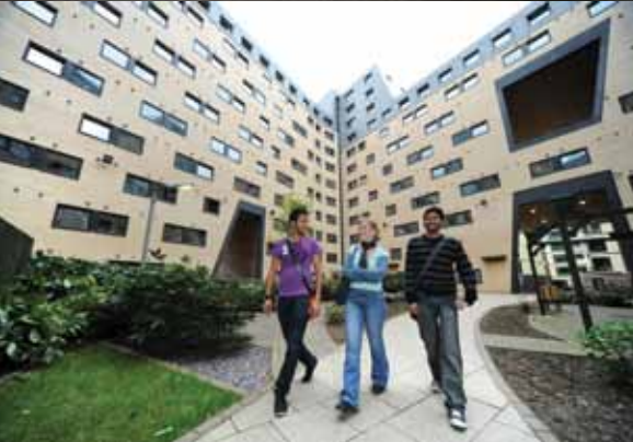
State-of-the-art Opal residences