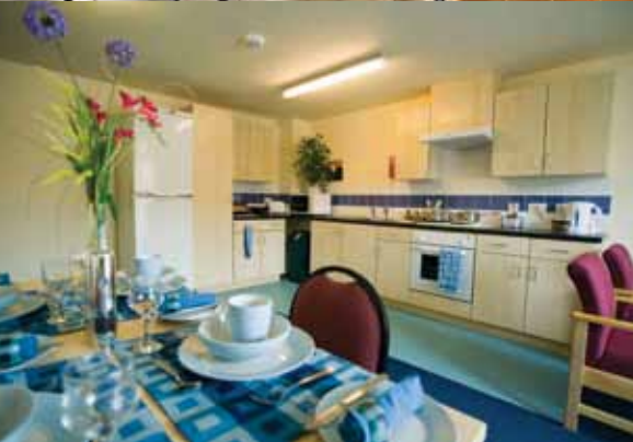
A kitchen at the state-of-the-art Opal residences