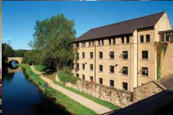
Award-winning Kirkstall Brewery

By the time you read this you will hopefully have already applied for your accommodation.