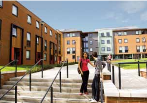
Carnegie Village located on Headingley Campus