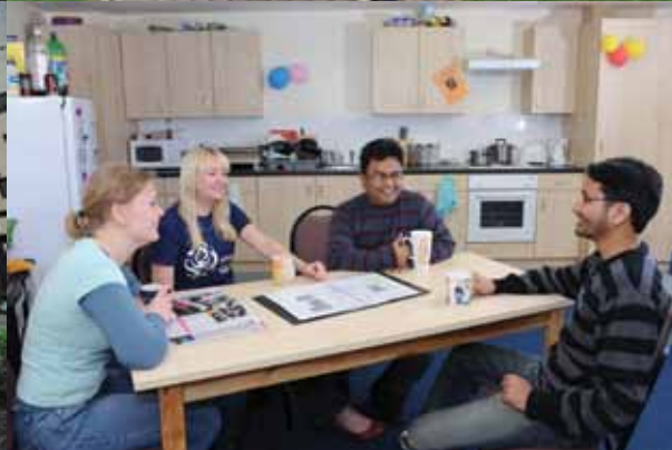
A kitchen in Carnegie Village