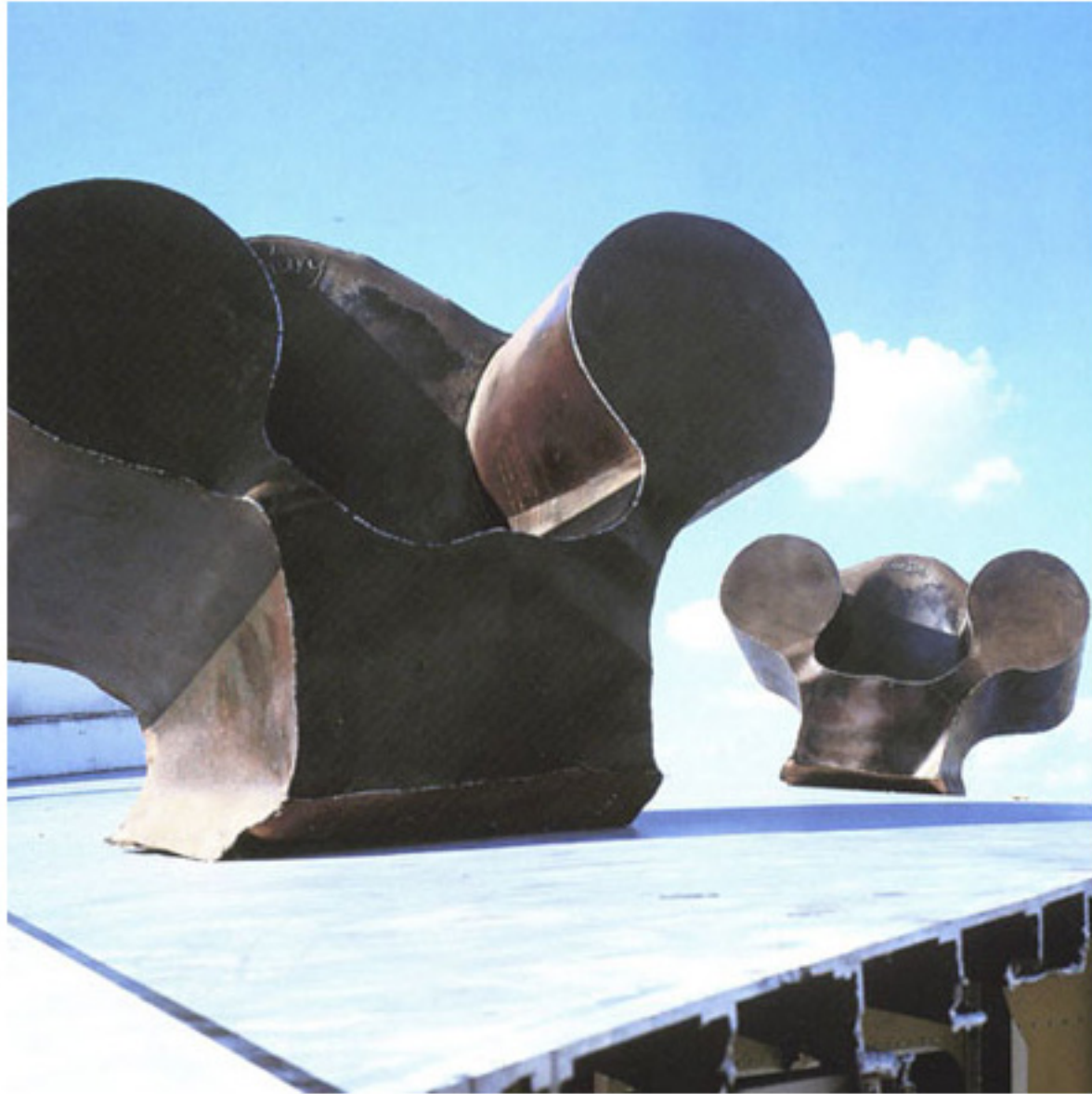
'The Big Easy' 1988

Another example of Arad's work that I admire is the 'The Big Easy' 1988, which is a large hollow welded steel volume with comically oversized arms. I like the brutal quality of a cosy form. Like many of his chairs they have been manufactured and mass produced by the likes of Vitra and Moroso, however, it's his early crudely formed pieces he made in his 'One Off' studio that drew my attention to his works.