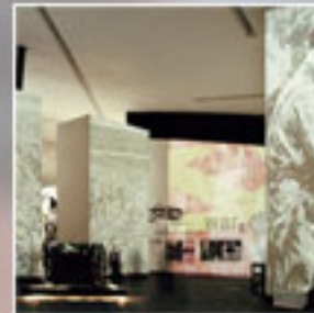
Imperial War Museum North, Manchester.

It's the award winning 'Big Picture' that engages the viewers with an audiovisual experience which totally converts the main space into an intimate emotional journey, projecting images onto almost every surface of the exhibition.