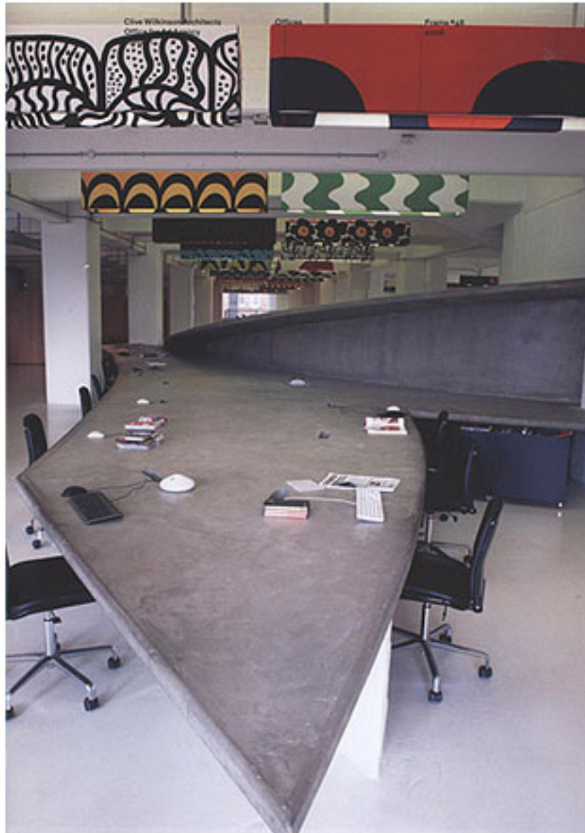
Ad agency Mother's 'raw' interior , Shoreditch.